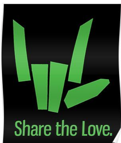
“Share The Love” logo