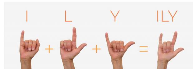
I love you sign

These attitudes towards ASL is nothing new, it’s been happening for years. For example, if we look back to the 1880 Milan Conference, this was a turning point in Deaf history because there was a ban on sign language. Many educators at that time believed oralism was superior, and did not want to teach deaf children their natural language. This decision almost destroyed sign language. The National Association for the Deaf (NAD) started a special fund to help try to preserve sign language. The Milan Conference still has a lot of negative effects today, and the Deaf community was not offered an apology until 2010, 130 years after the ban. Inventor of the telephone, Alexander Graham Bell, was a staunch promoter of oralism despite having a deaf mother. He believed that deaf people should NOT procreate with each other, because he did not want the deaf gene to be passed down. He strived for a homogeneous society, where everyone was able to speak and hear, not sign.