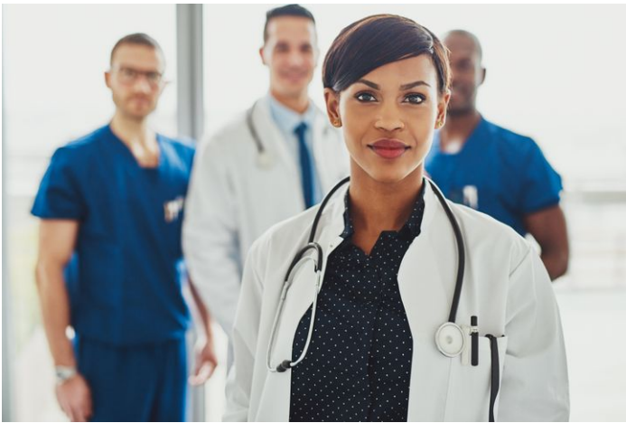
Male and Females of mixed ethnicities in the same workspace

The key to fixing this problem starts in medical schools, where the acceptance rate for female applicants needs to increase further.